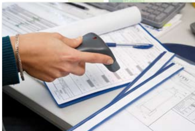
Scanning a step in the workflow