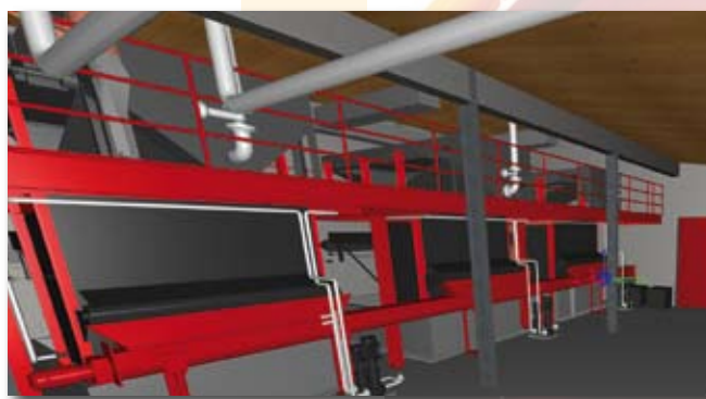
MicroStation* 3D model of a wastewater treatment plant belonging to PWT Wasser- & Abwassertechnik GmbH