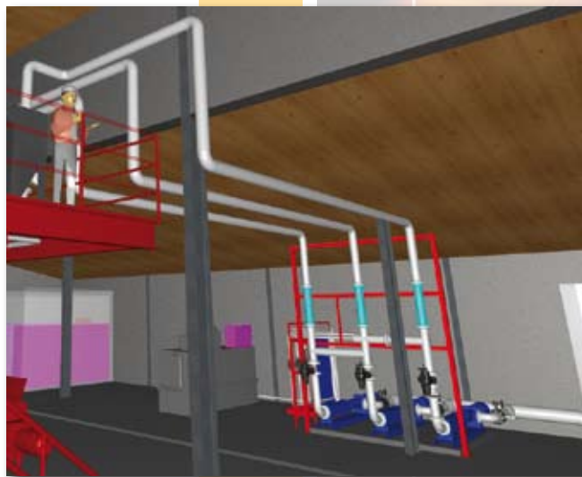
MicroStation* 3D model of sludge pumps

* MicroStation is a registered trademark of Bentley Systems, Inc.