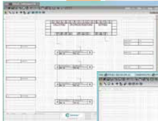
Graphical function/workflow planning in line with VGB

“ Smooth integration of user-specific components and component libraries ”